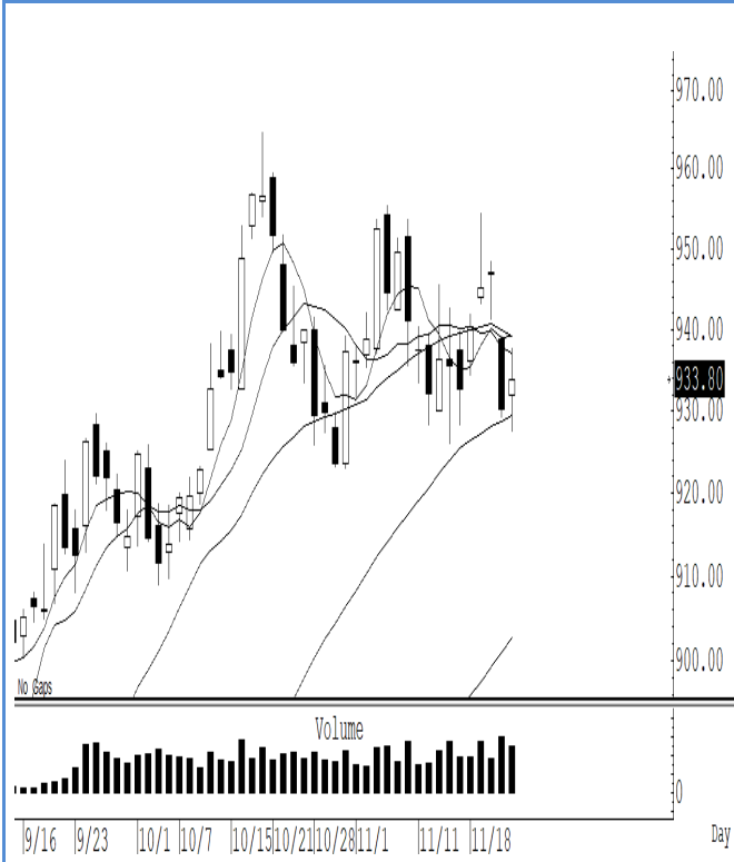
S50Z24 (Close 933.80 Chg 3.60)